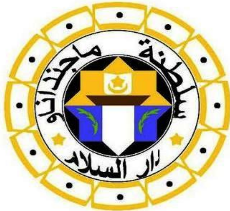
The Royal Seal of Maguindanao