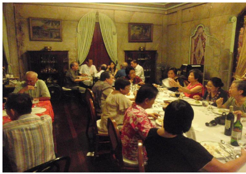
and more Food