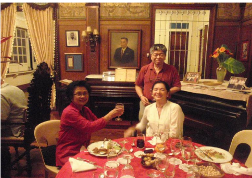
and more Drink