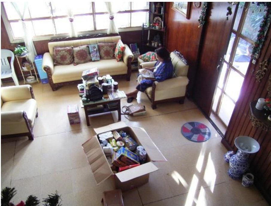
The beach house is 6 km away from town (Tanjay City, Neg Or) where the main house is located on the main street. Above is the sala prior to the extensive upgrades we made. Note the opened balikbayan box. We shipped 21 in all. That's Lisa doing some knitting.