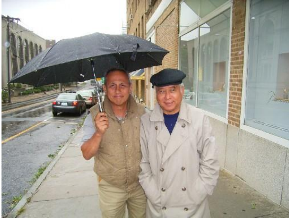
Or quaint little places like Greenwich that pack a wallop behind the scenes.