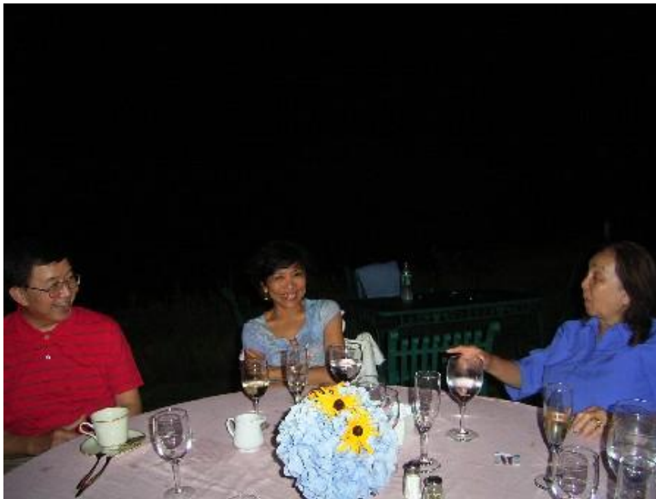
But in contrast, here in the US, you may have friends with Estates like that of Loida, or your very own at South Hampton.