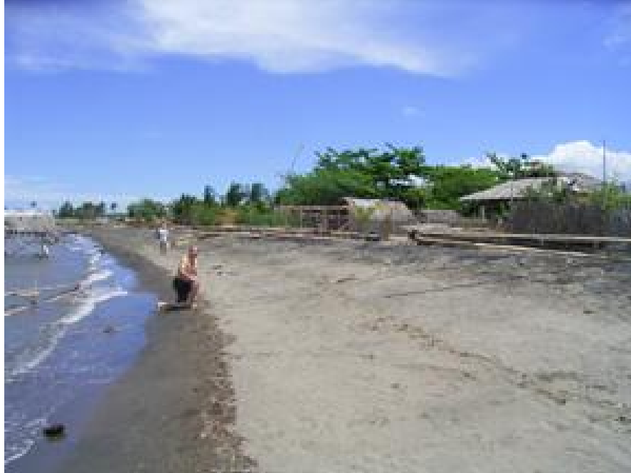
The beach at low tide, with beach hut on the right. That's me posing.