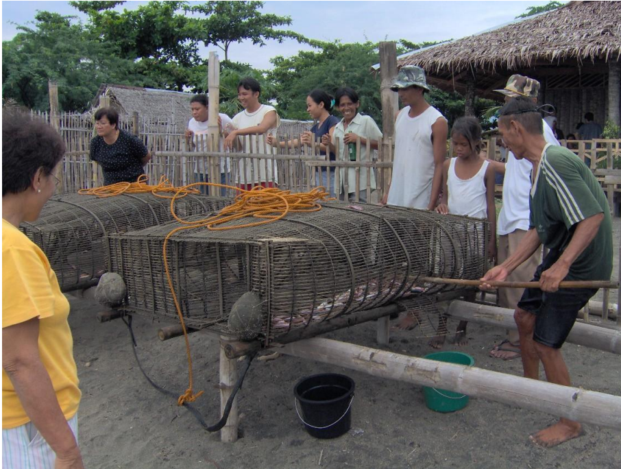
Harvesting the catch from fish traps. We bought one such trap, and the arrangement with the fishermen is that we split on the harvest, though we pay for the fuel for their boats. They set the traps weekly.