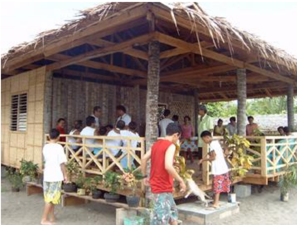
All finished. This was the house blessing.