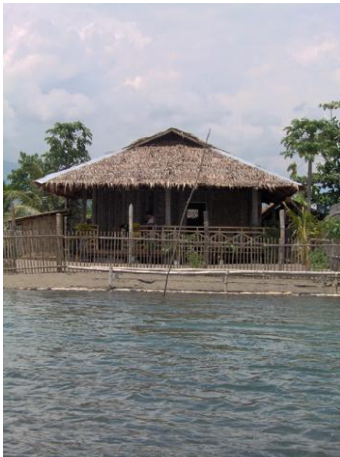
View from a fisherman's boat at high tide.