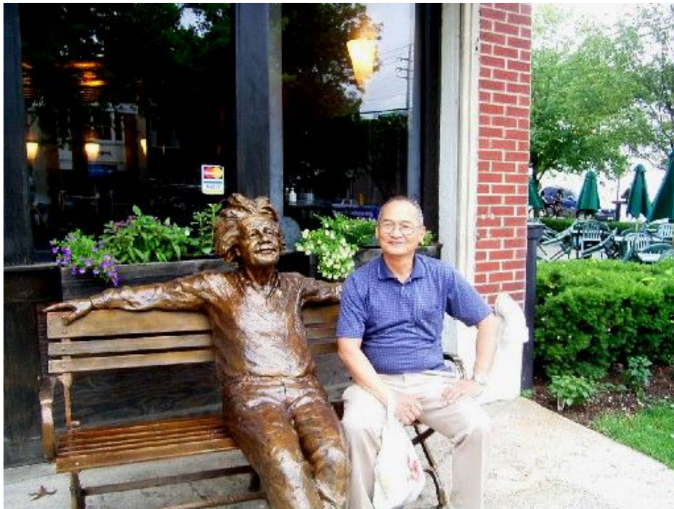
You can even sit with Einstein.

But for me, home I go, to settle in Tanjay, and visit Makati once in a while.