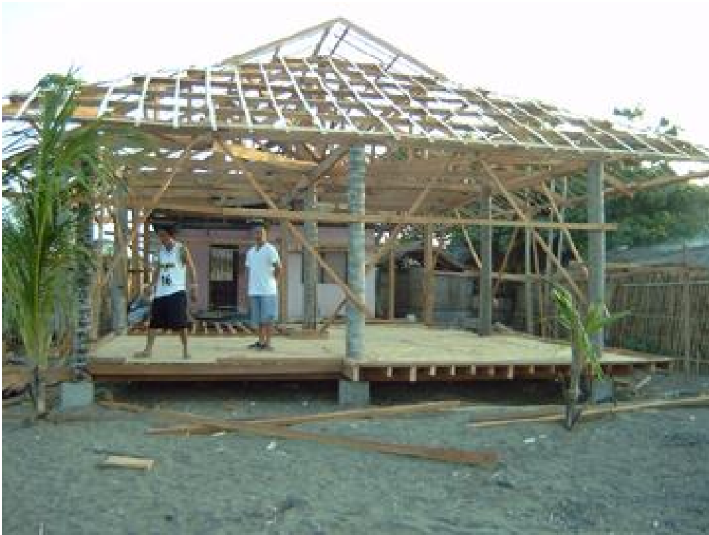
The hut abuilding. Notice existing structure behind. It had concrete walls on 2 sides, with septic tank, etc.