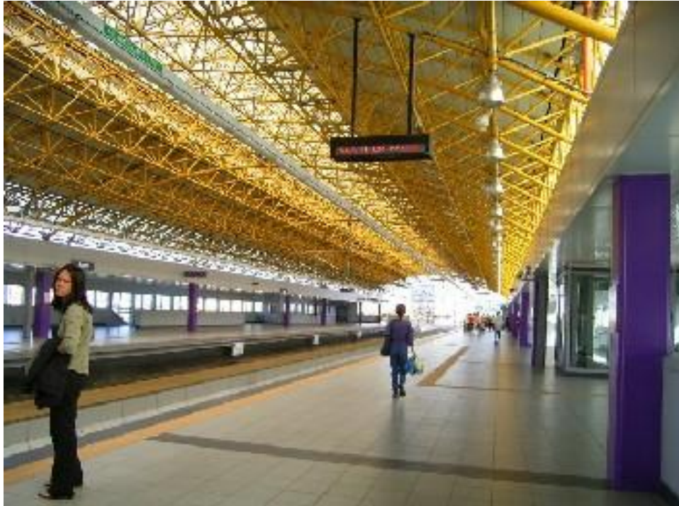
And perhaps you haven't ridden the newest LRT from Recto (Azcarraga) corner Avenida, all the way to Marikina. Neater and cleaner than NYC.