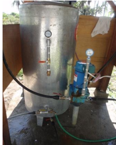
Deepwell and tank later installed as cheaper alternate to buying Nawasa.