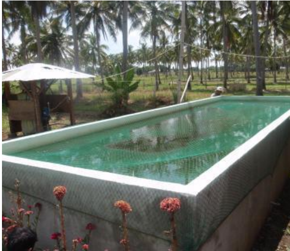
Concrete water tank built as reservoir for the slow-running Nawasa water. Now a fish tank.