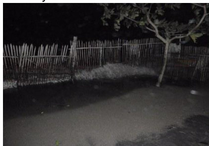
Sea assaulting 3rd fence we built. Other trees already washed away.