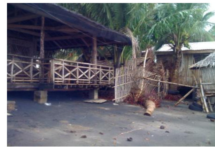
2012 view of house with foundations being eaten away by sea.