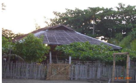
2007 view from shore, with new trees in front yard and house behind.