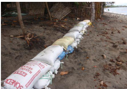
Sandbagging fence line after it was washed away. Didn't help.