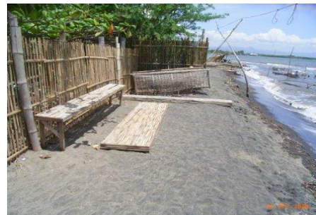
2008 view of shore looking towards river mouth. Shoreline much closer.