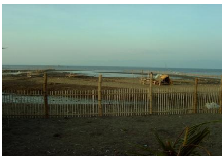
2005 view from new house. Note fence and sand bars further off.