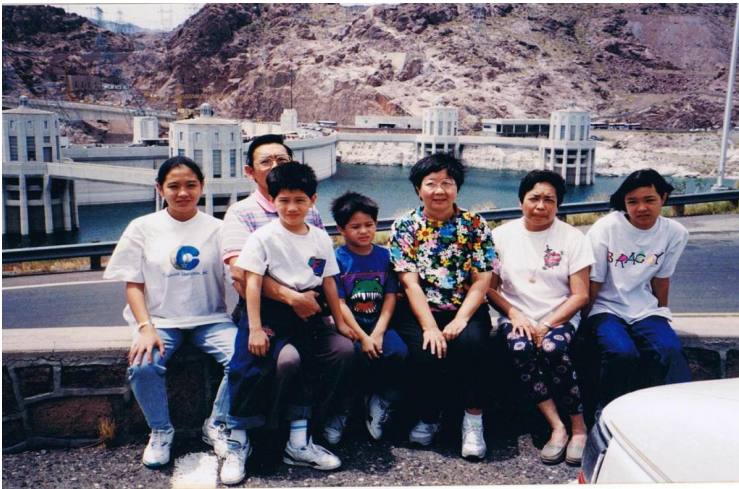
Pix 5 - About 1996, with the Abads and Gils. Note intake towers in background, and how water level was much higher.