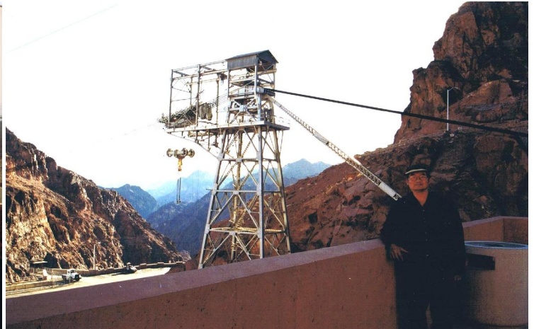
Pix 2 - Taken in 2000. Is it possible construction of new bridge started much earlier, and device are the spinners for the suspension cales?