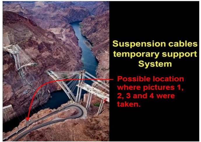
Picture lifted off referenced article, with added red notes. Probably taken sometime between 2005-2010