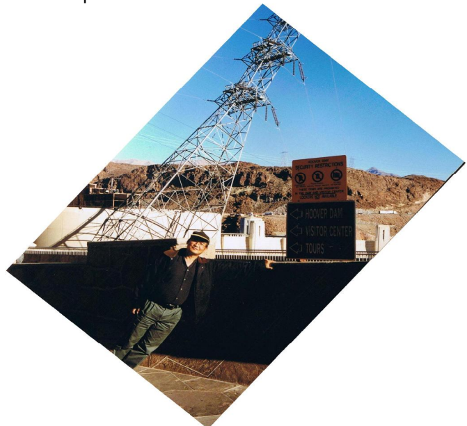
Pix 4, right - Same set in 2000, with slanted camera and me standing slanted to match electric tower holding high tension wires.