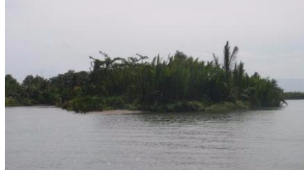
We decided to have our lunch picnic on the boat. We'd have difficulty climbing up over the