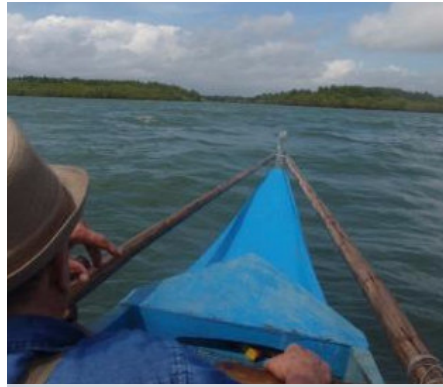
Photo at left shows the boat heading towards the river mouth. Once in the river, it was all serene and easy sailing. Photo below on left shows the well known river island which was once jokingly proposed to be a casino site