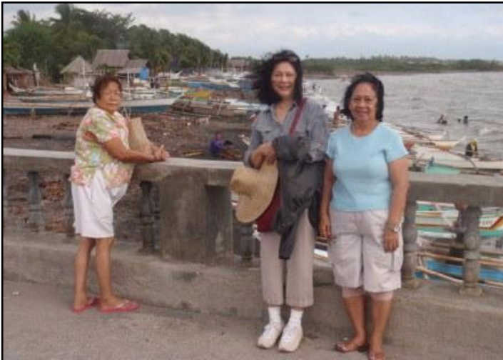
The belles pose before the journey. Background is the northward view with shoreline and fishing boats. An on-going City project calls for making this shoreline into a boulevard extending almost to the river mouth.