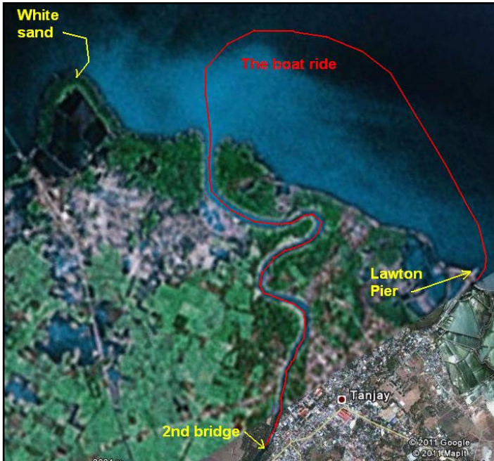
Google map of Tanjay and vicinity. Red line traces the route of the eventual journey. It took about 1-1/2 hours.