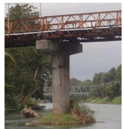
By this time, we were in no mood to go back to the pier via the sea route. There was an easier way: go past the Tabuc bridge to the new bridge (seen further on right photo), clamor up the staired embankment, cross the bridge and then walk