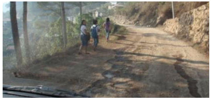
Down the dirt road from Sagada to the main road.

After breakfast (complimented by Aclay's bread) in the hotel, we hit the road. Since we now had only one driver, I occupied the seat up front beside him.