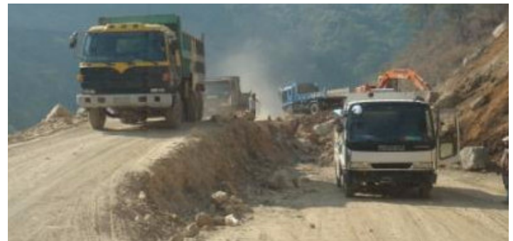
Occasional one-lane sections undergoing upgrades on the Halsema road towards Baguio.