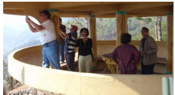
The first rest/view stop on the Halsema Road.

... to be cont'd, last series ... Danny Gil, 4/2/10