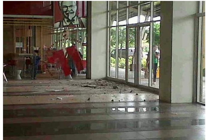
Broken glass windows at Dumaguete Mall, FB