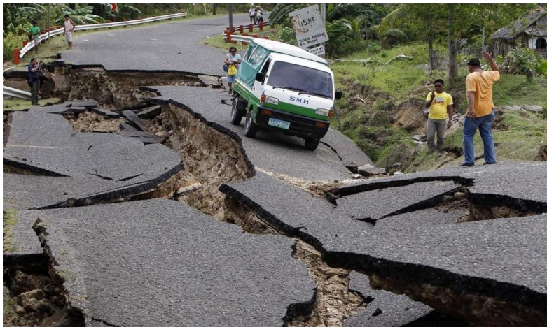
Road damage at Guihulungan, further north of La Libertad.