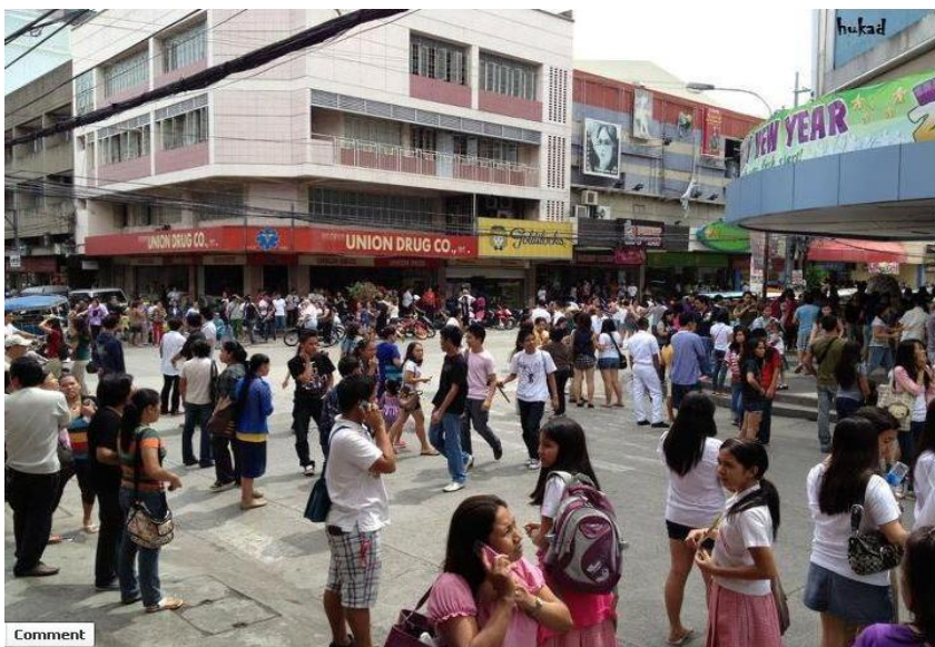
Milling around at downtown Dumaguete, FB

My excerpted email 2 hours after Feb 6 noon earthquake: Not to worry. We all are OK. It hit at noon Monday, and was relatively strong, about 50 secs. Power went off. Then we went to check the church and it still was standing (remember how I've harped long and loud about how the priest removed all the 18 roof pillars 3 years ago). In Tanjay, no structural damage it seems. Thirty five minutes later, another strong after shock occurred, about 17 secs. Power came back in an hour. From news bits here and there, via text, phone and TV, epicenter was in the sea between Cebu and Negros, 6.8 on scale. Much stronger in north towns Tayasan, Jimalalud and La Libertad etc. Bodega in farm at La Libertad had walls collapse. There are tsunami warnings now for the next 2 hours.