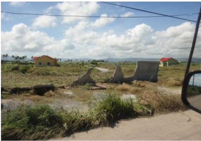
Downed concrete fence, subdivision along Tabuc road