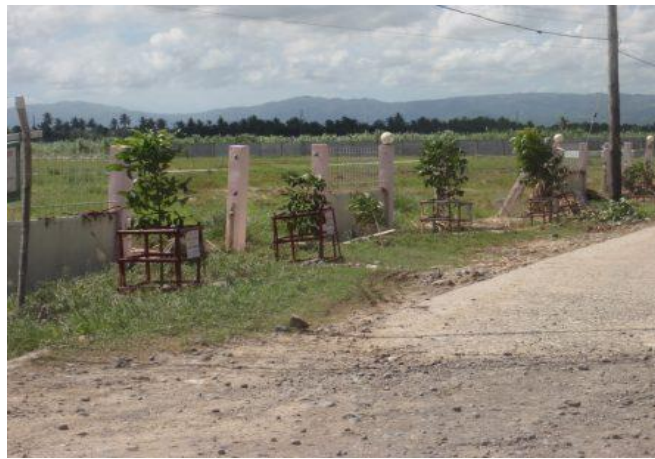
Downed portion of Serenity Cemetery side fence