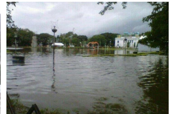
Dumaguete capitol