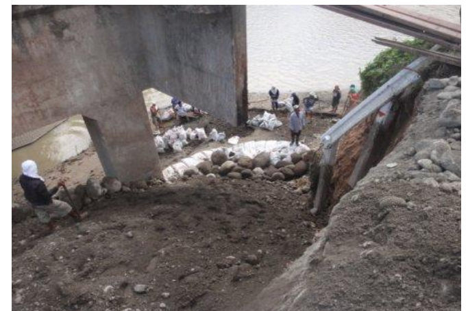
Left, middle & right views of eroded side of bridge, Dec 19. Dept of Public Works personnel working to build back retaining wall and embankment.