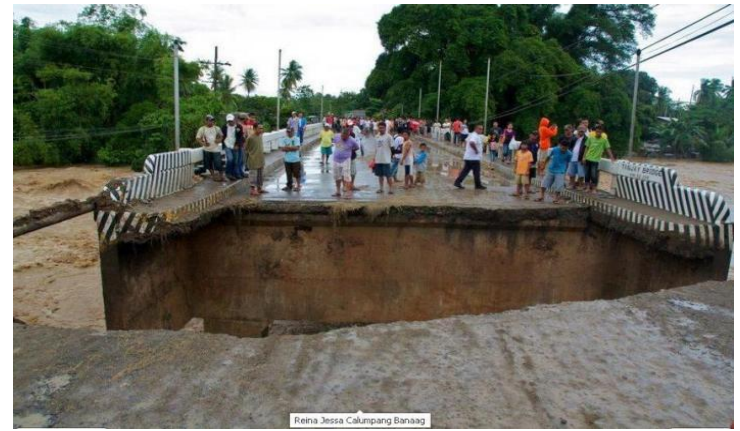
View from the eroded side of the bridge