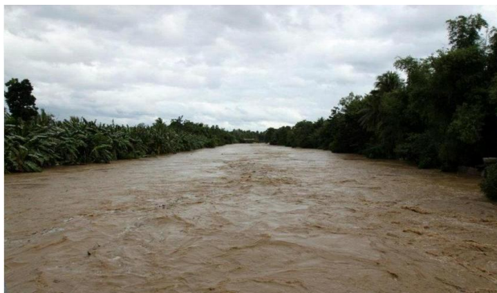
Down stream view from New Tabuc bridge, height of flood