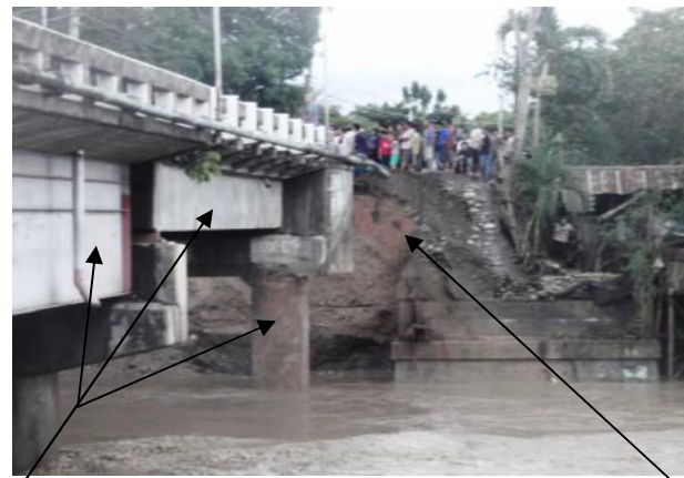
Later, water subsided but embankment eroded while steel beams and concrete pylons remain intact.