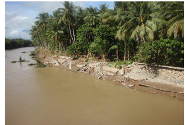
Up stream view of damage, Tabuc side