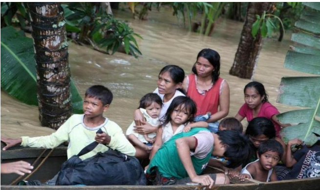
Untitled, but probably at Kasagingan