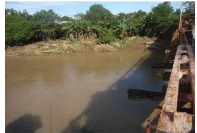
View from Old Tabuc bridge

Below: Miscellaneous photos taken from Facebook posting of "Assenso Tanjay", probably different sources showing various scenes, described under each photo.