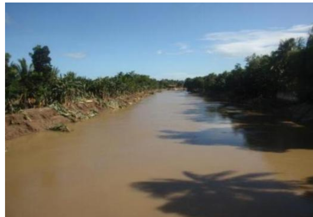
Same view after flood receded