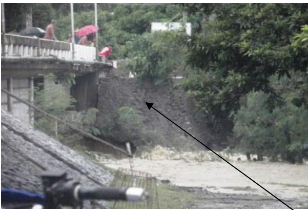
Main bridge at height of flood. Note embankment