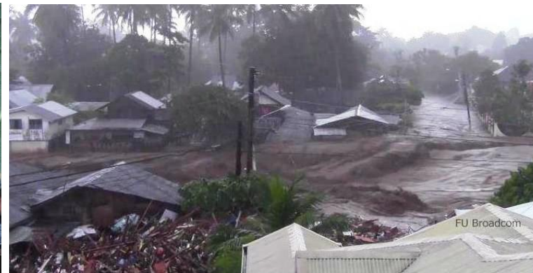
Banica river, Dumaguete