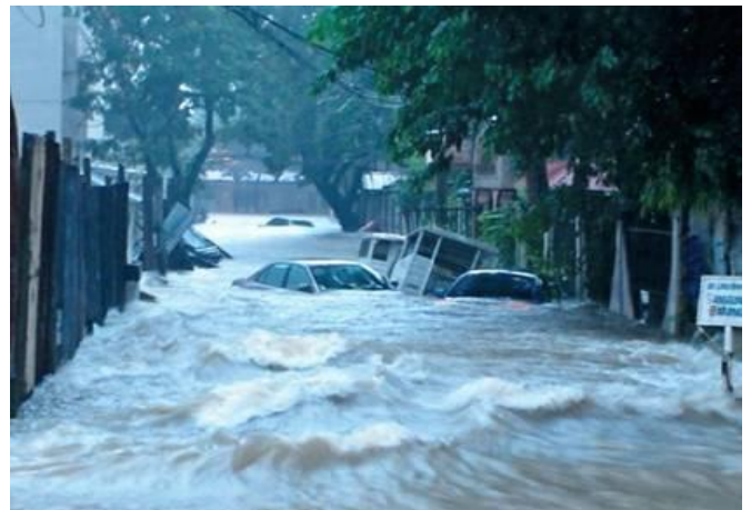
Pic 7 - original label was Katipunan Ave near Ateneo