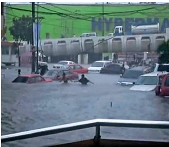
Picture 1. At the crossing of Buendia (now Sen Gil Puyat Ave) and the overpass of the South Superhighway. This always was a flood prone area from time immemorial, until the massive drainage project on the nearby esteros (Tripa de Gallina, etc) improved the system, but not enough for this flood.