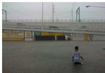
Picture on left was originally labelled Pasong Tamo, which on the Google map is somewhere to the right, parallel to the South Superhighway.