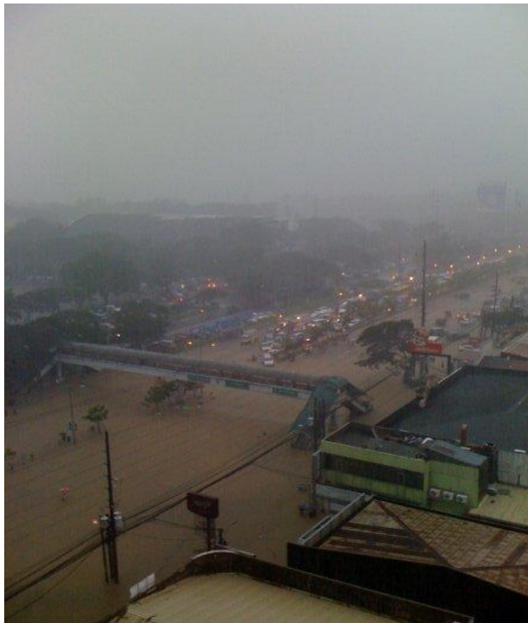
Pic 6 - original label was Katipunan Avenue Ateneo. Obviously, that is the pedestrain overpass, with view taken from a highrise. See additional comments on the Google map.