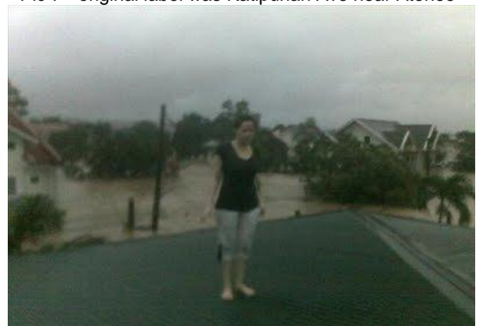
Pic 8 - original label was Actress Christine Reyes on her Provident Village house roof.