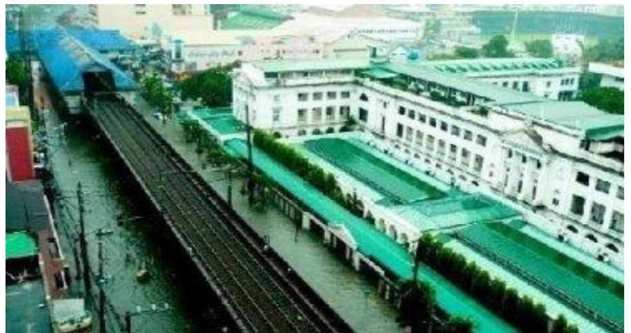
Picture 2. Obviously taken from a high rise across from De La Salle University with the Light Rail Transit (LRT) and its nearby station.